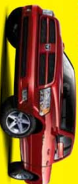
2012 Dodge RAM 1500 SXT Ext Cab